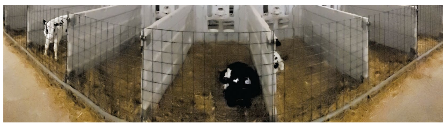
Krynenhill Holsteins, Thorndale, Ontario Canada

"We're not happy that a calf died this week, but we sure are proud of the work we have done to make sure that this calf was the exception, not the rule!"