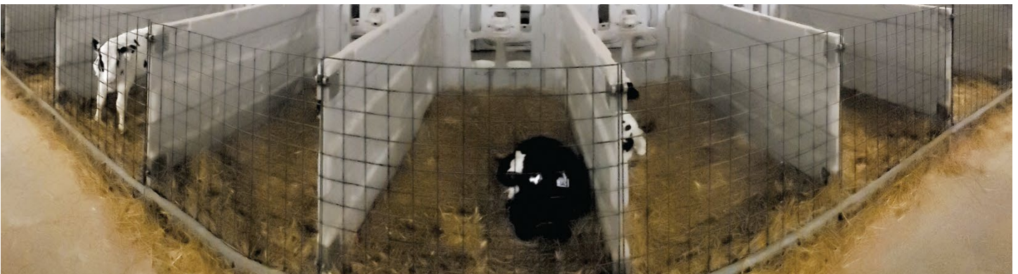
Kryneshill Holsteins, Thorndale, Ontario Canada

“We’re not happy that a calf died this week, but we sure are proud of the work we have done to make sure that this calf was the exception, not the rule!”